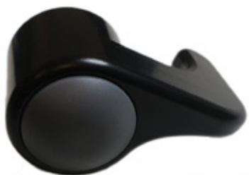
Wrap Around Handle