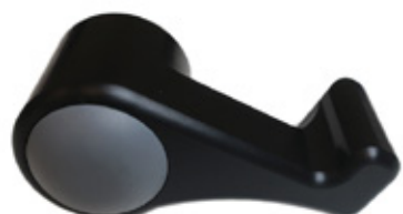
Vertical Hook Handle