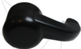
Hook Back Handle