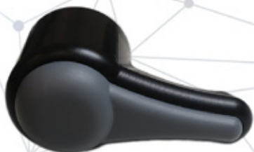
Duck Beak Handle